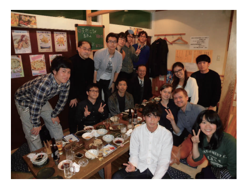
Farewell party on 21st November 2016