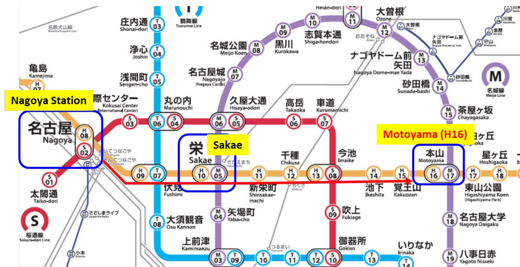
Subway network in Nagoya:

Emergency contact (Egami): Tel. 090-2930-7968 / egami@aitech.ac.jp